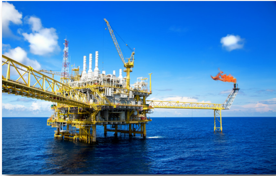
MARINE AND OFFSHORE