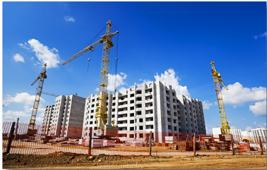
MECHANICAL & ELECTRICAL CONTRACTORS

Marking Services is well-versed in the identification marking needs of virtually every kind of facility. We can make pipe marker, valve tag, hazard identification, and safety sign recommendations that provide greater value to you than boilerplate products or specs that are out of date. Providing valuable identification services and products to a wide variety of commercial and industrial industries, we are well versed in requirements and regulations for identification marking.