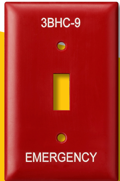
Plastic Cover Plates Engraved and Color Filled