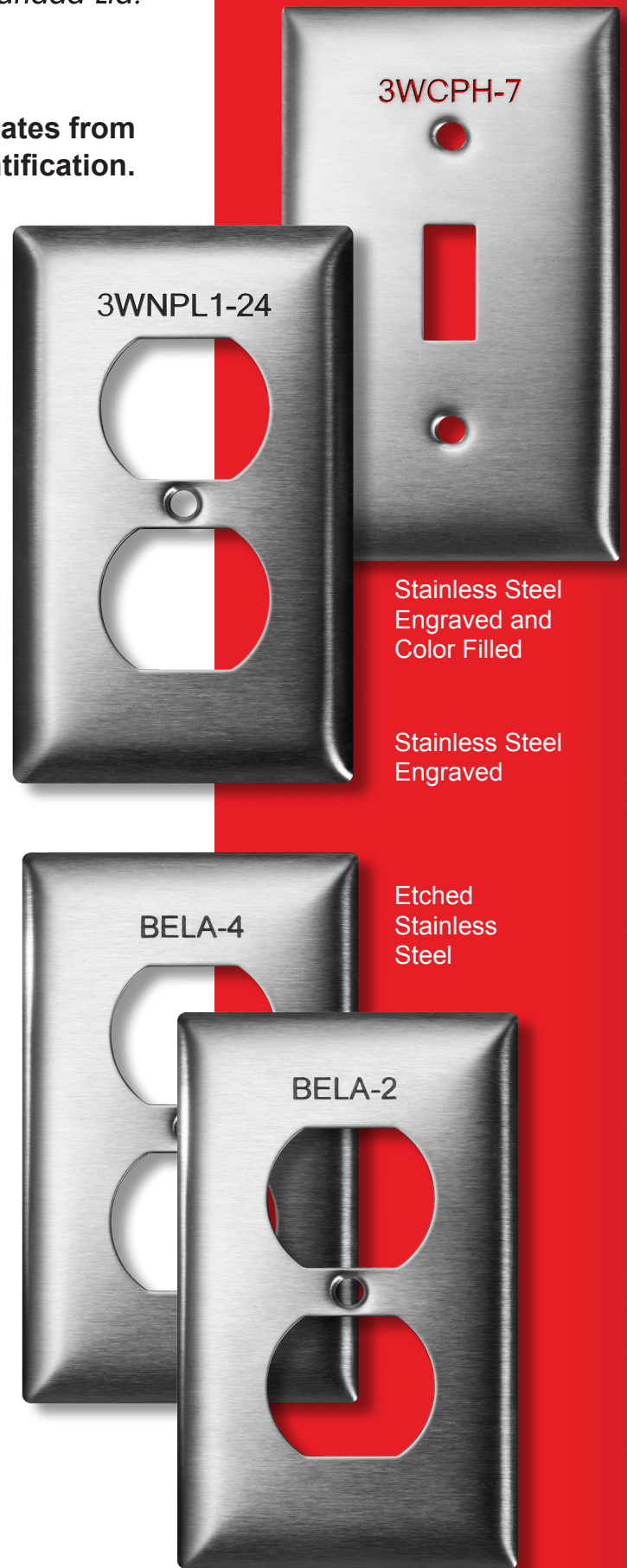
Stainless Steel Engraved and Color Filled

Ph: 780.986.8480 • Fax: 780.986.8486 • sales@markserv.com