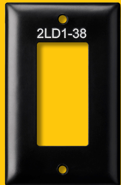
See reverse side for stainless steel options.